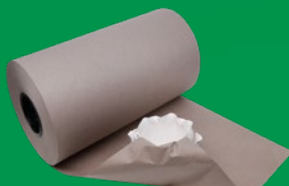
Gray bogus rolls and sheets