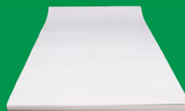
Newsprint rolls and sheets