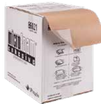
Easy to dispense options