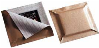
Kraft paper lined foam & bubble