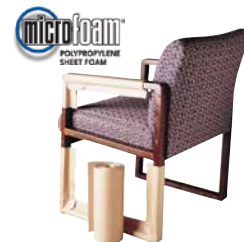
Perforated rolls for hand applications