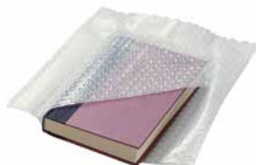
Standard clear bubble packaging